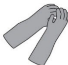
Heat Resistant Gloves