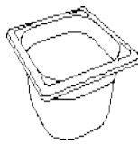
Gastro norm Metal pan