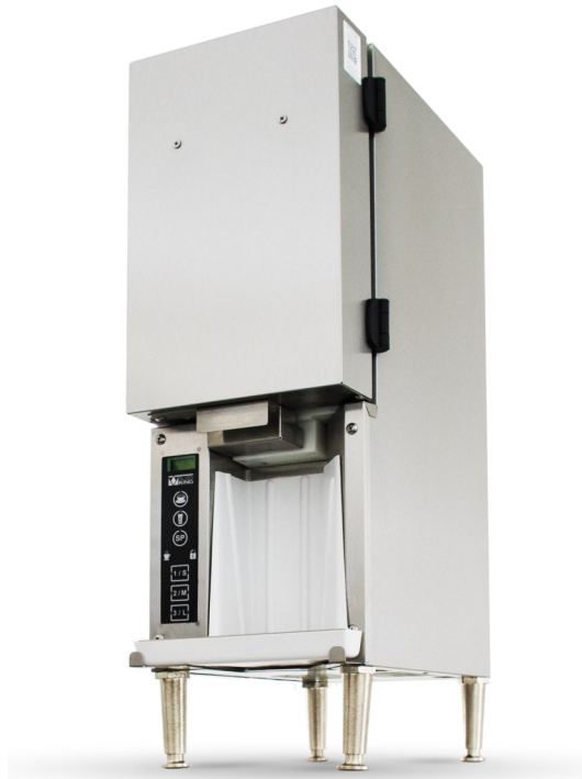
SK-1 Dairy Dispenser