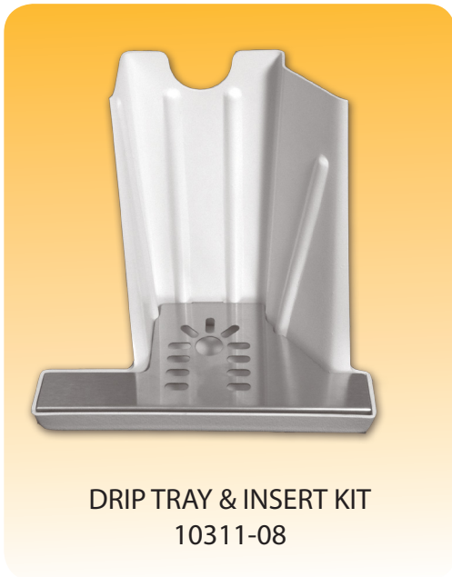
DRIP TRAY & INSERT KIT 10311-08