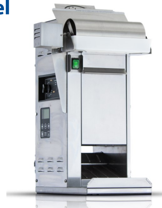
Shown With DCFT-BWART-MCD